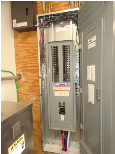
No issues in main or sub panels