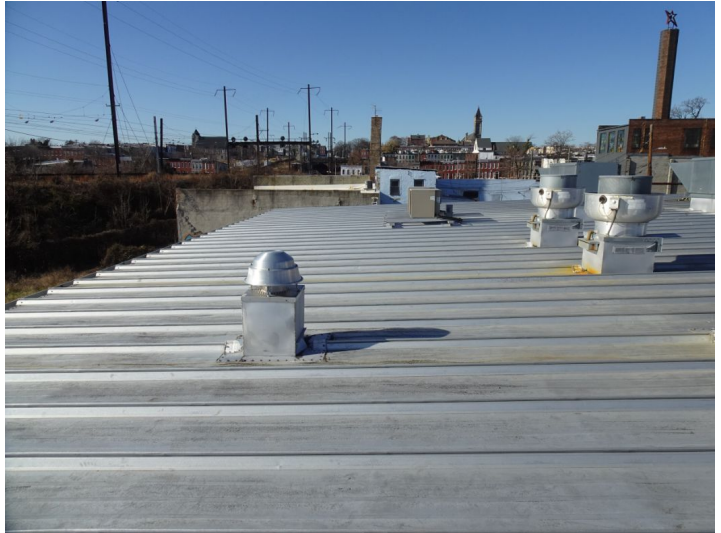
Roofing, HVAC units, vents and refrigeration units.