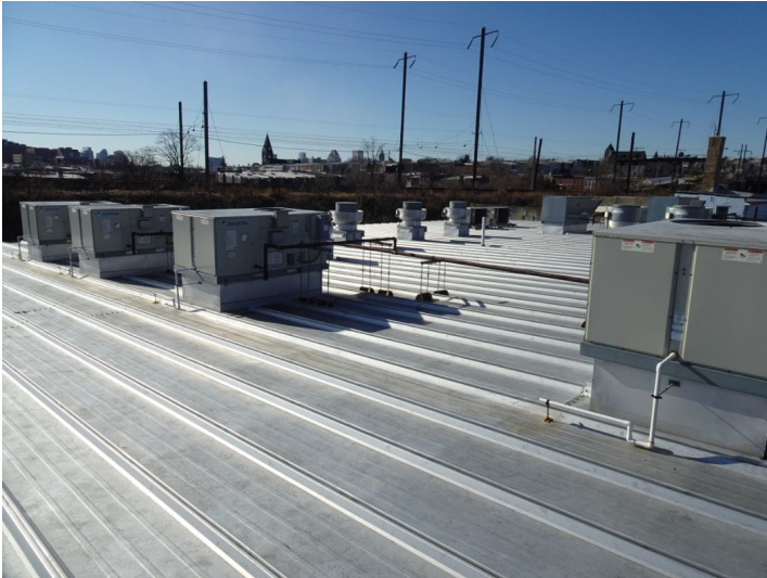
Roofing, HVAC units, vents and refrigeration units.