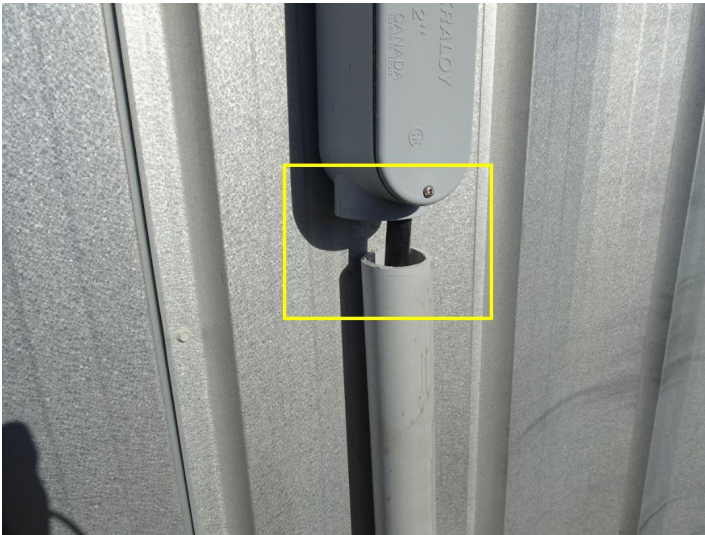
Gap in conduit pipe at rear wall, may allow water intrusion. Seal as necessary