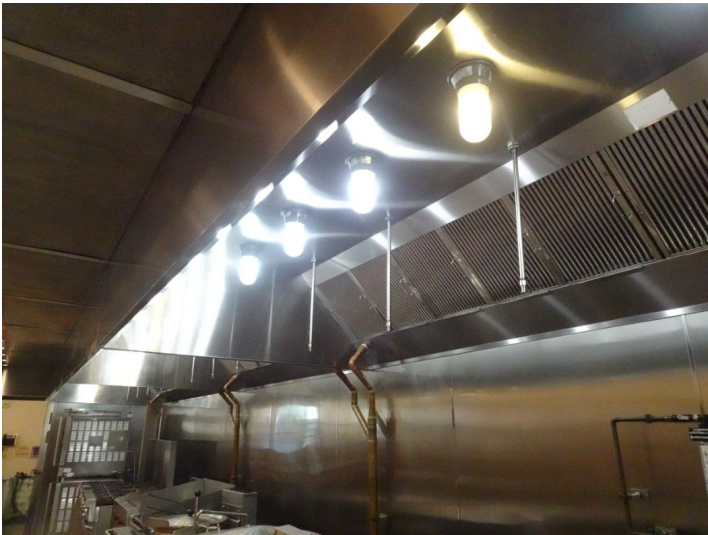
Exhaust vents operational