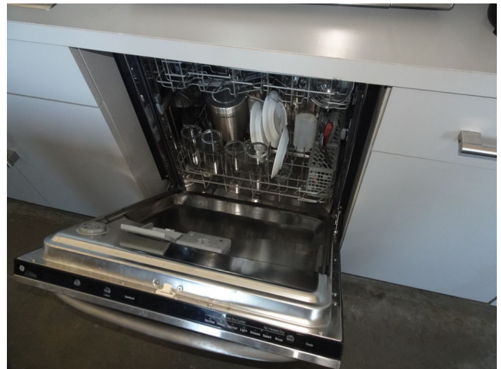
The dishwasher in the staff kitchen did not start from controls. Did not appear to have power. Repair.