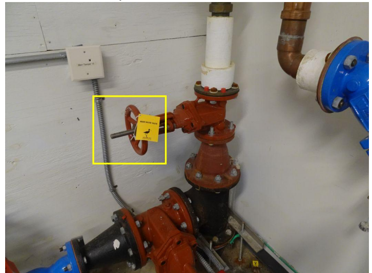
Main water valve location