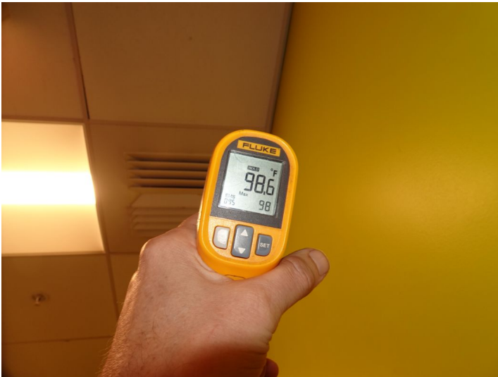
All heating units were operational