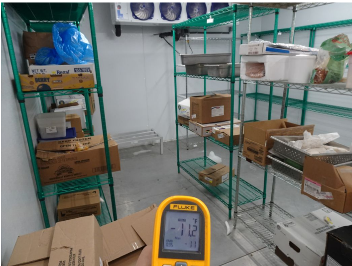
Temperature - Walk in freezer