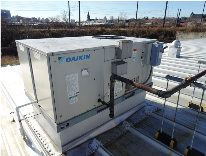
HVAC unit mfg. date(s) - HVAC units circa 2017