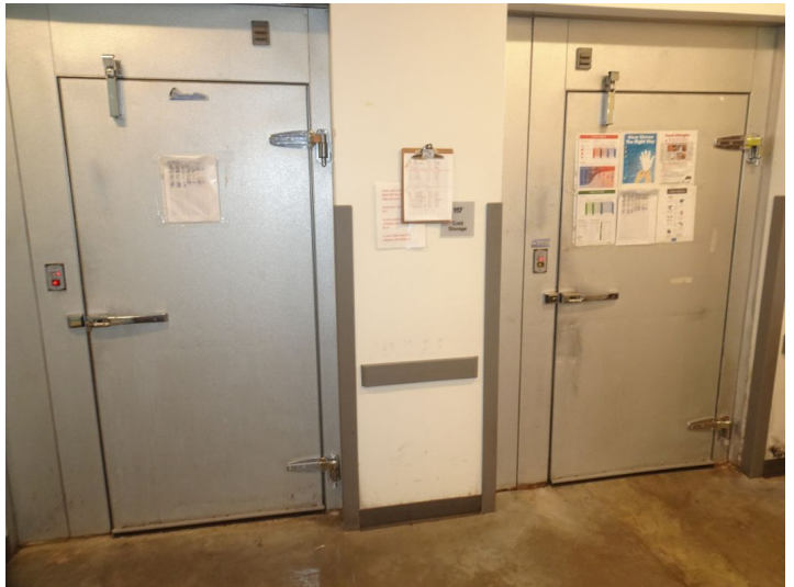
Walk in freezer and refrigerators