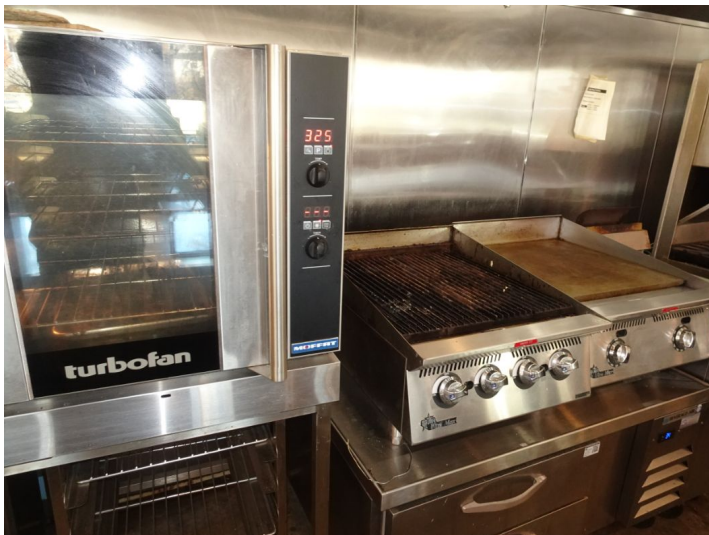
All major equipment in the teaching kitchen was functional