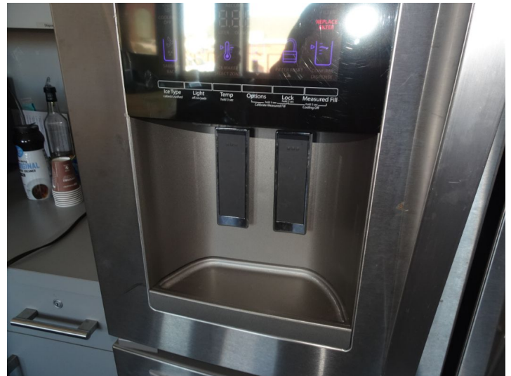
Refrigerator water/ice dispenser nonfunctional, staff kitchen. May not have a water line.