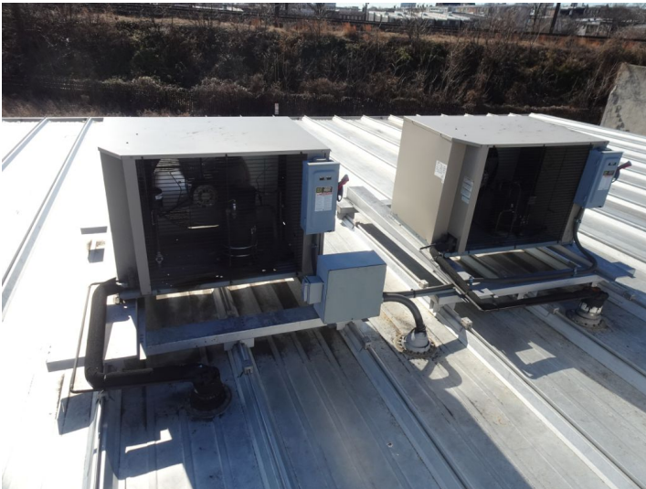
Refrigeration unit's circa 2017