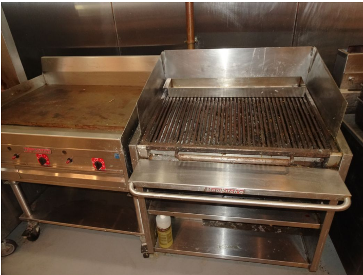
All major equipment in the production kitchen was functional with the following exception- the deep fryer could not be tested without oil in it and two refrigeration units were unplugged at time of inspection.