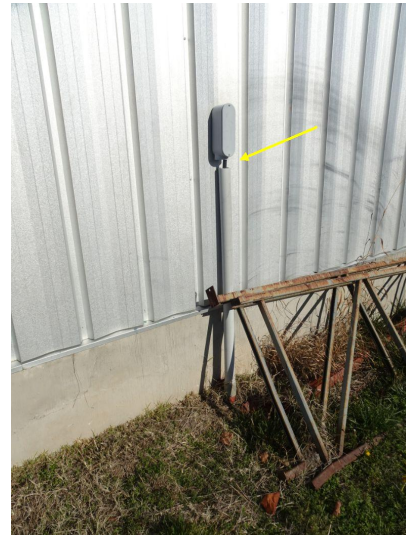
Gap in conduit pipe at rear wall, may allow water intrusion. Seal as necessary