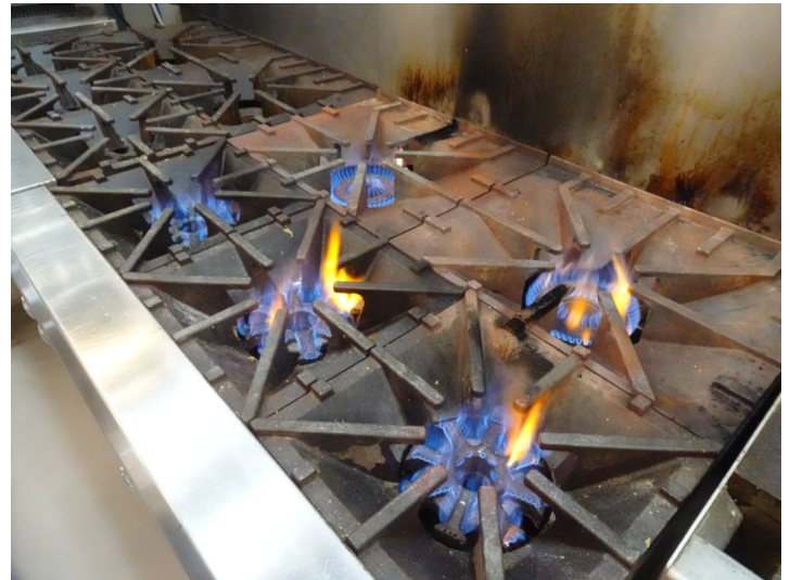
All major equipment in the production kitchen was functional with the following exception- the deep fryer could not be tested without oil in it and two refrigeration units were unplugged at time of inspection.