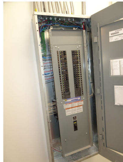
No issues in main or sub panels