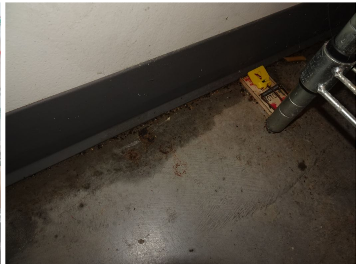
Signs of pest activity. Have pest specialist evaluate and treat as necessary