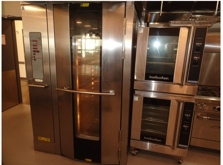
All major equipment in the production kitchen was functional with the following exception- the deep fryer could not be tested without oil in it and two refrigeration units were unplugged at time of inspection.