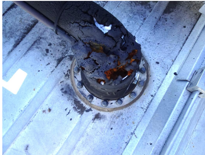
A few "pitch pockets" for roof penetrations of refrigerant/electrical lines need new sealant. Repair as necessary.