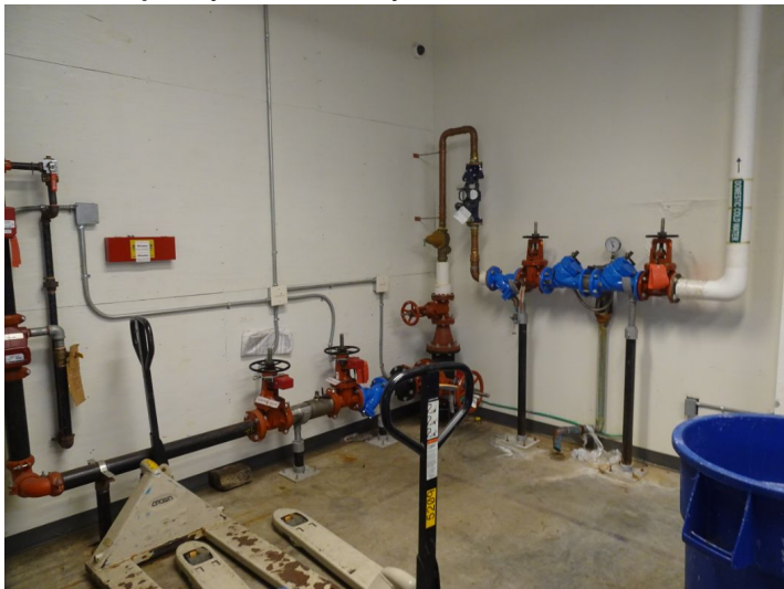
Gas and water and sprinkler controls