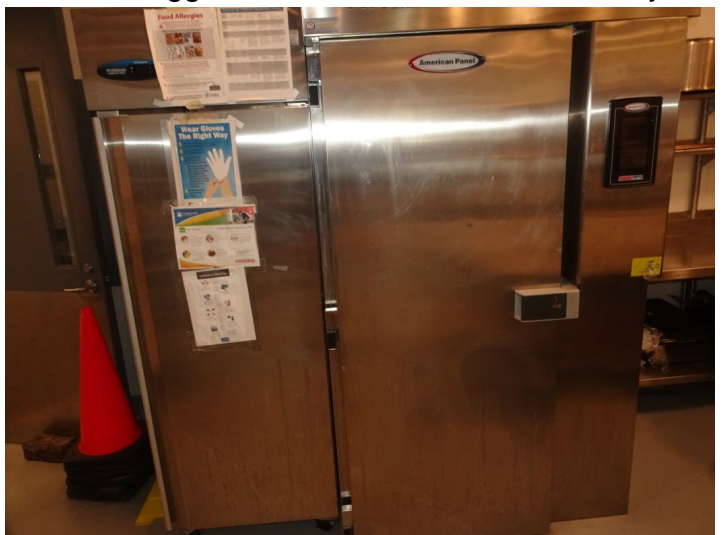
Some refrigeration units were not in use