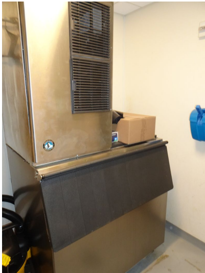
Icemaker in hallway closet was off/non-functional at time of inspection.