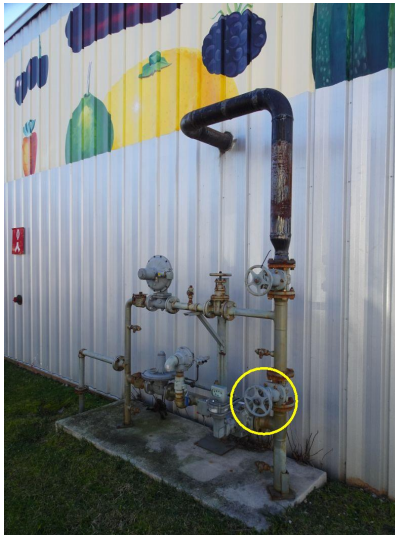
Gas Valve location - Exterior north wall