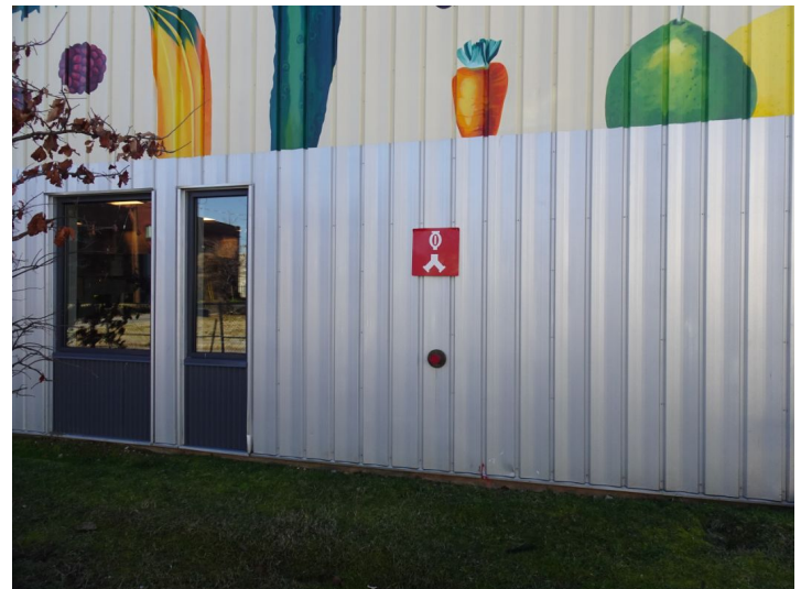
FDC standpipe connection