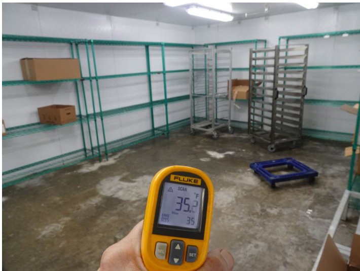
Temperature - Walk in refrigerator