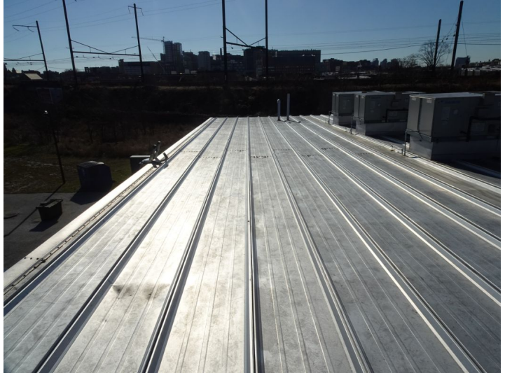
Roofing, HVAC units, vents and refrigeration units.