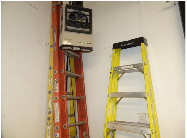
A wall hung heater in garage did not respond to thermostat. Repair as necessary