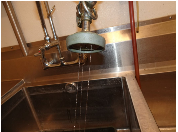
Some hand sprayers in the production kitchen were clogged, blocked. Clean as necessary.