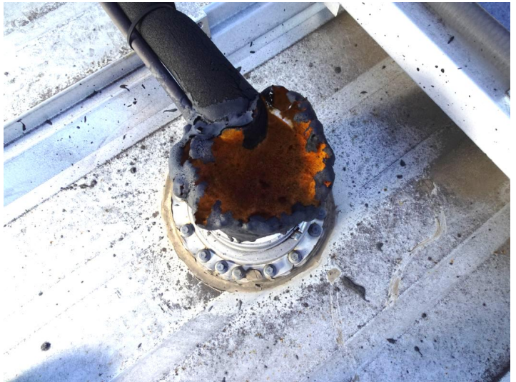
A few "pitch pockets" for roof penetrations of refrigerant/electrical lines need new sealant. Repair as necessary.