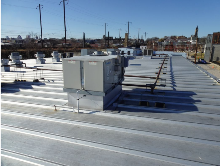
Roofing, HVAC units, vents and refrigeration units.